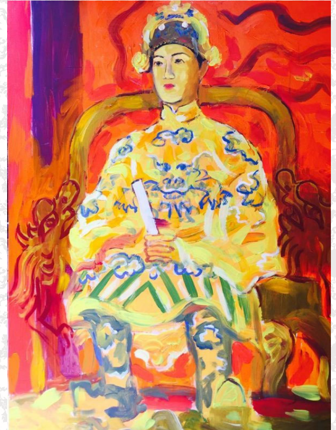
Emperor Bao Dai (1913 – 1997) A piece of art of Pham Luc Artist

For experienced travelers, the boat is a discovery in itself. There are 10 en-suite cabins with a private balcony or ocean views, a butler service and a limousine. Each suite has a specific design with a story to tell, maximizing comfort and the use of daylight. Travelers will relish spending time on our floating classic luxury hotel, using it as a base to escape to nature, the sea, beach and islands and take part in activities on board and on the water as they cruise around the bay.